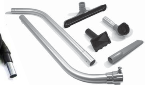
630-A001 Additional kits available