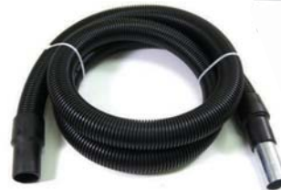
671-VHX24-20 Additional lengths available