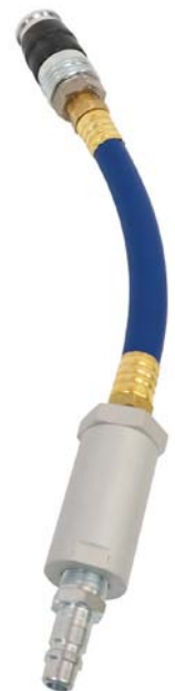
Air Filter Quick Disconnect