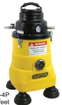
WH-105-4P Available with rubber cup feet