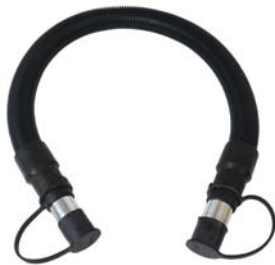
671-VHA24-003 Safe Filter Change Hose