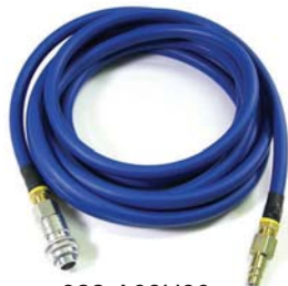
922-A08H30 Additional lengths available