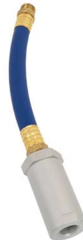
Air Filter Integrated