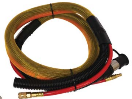
Air/Vac Work Hose Conductive / All Brass Fittings