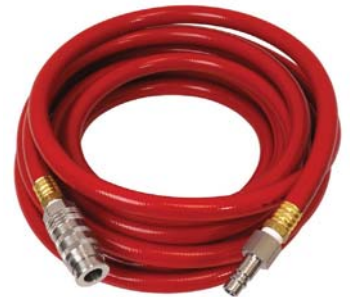
Compressed Air Line Conductive / All Stainless Steel Fittings