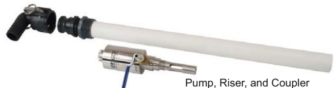
Pump, Riser, and Coupler