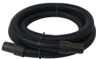
1-1/2" x 20' hose