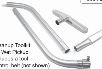
Cleanup Toolkit for Wet Pickup includes a tool control belt (not shown)