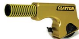
Cutoff Saw 1/4" Arbor