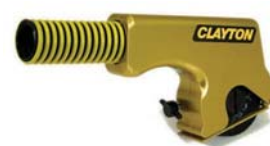
Cutoff Saw 1/4" Arbor