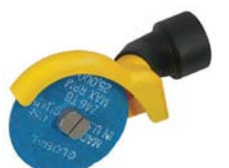
Radial Shroud 3/8" Arbor

★ Available on GSA Advantage website @ www.GSAadvantage.gov