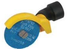
Radial Shroud 3/8" Arbor